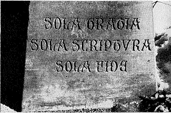
Seminary Corner Stone