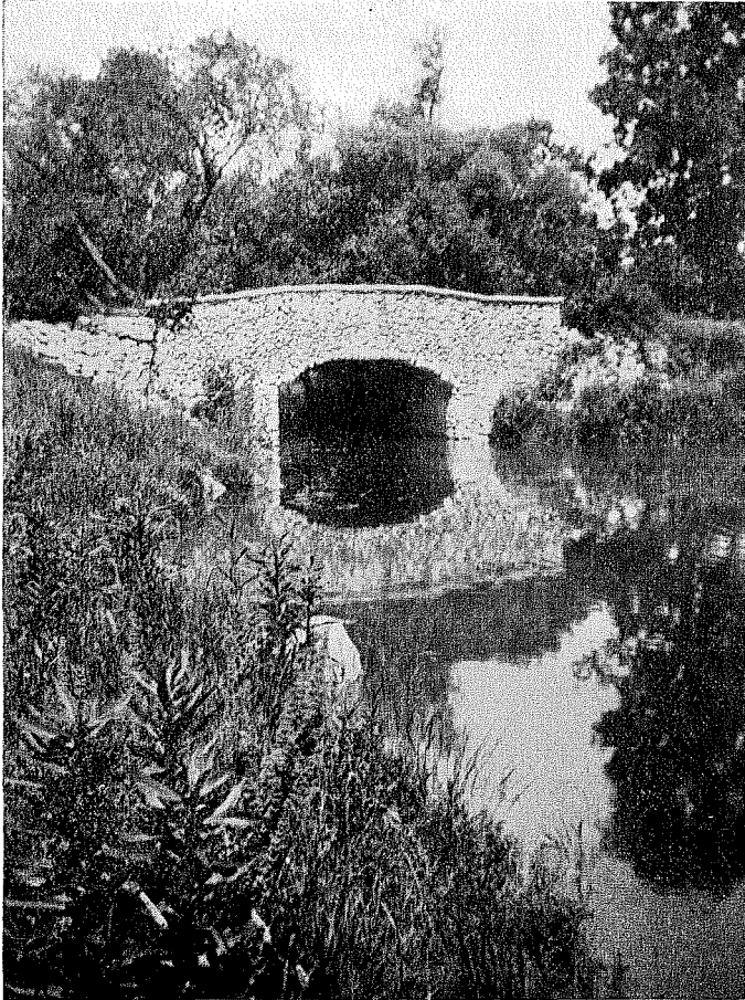
Scene Along the Northern Entrance Lane