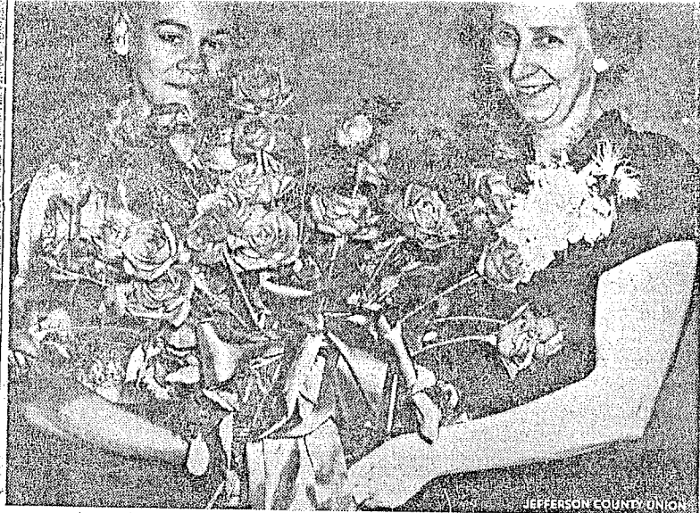
JEFFERSON COUNTY UNION