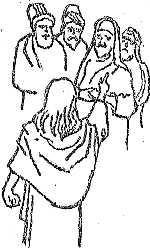
"Beware of the leaven"

When we speak of the image of the Pharisees, it seems they were generally admired by the people of their day, although they also had detractors. People loved their sets of values, and their rules and regulations. They depended on the advice of Pharisees for everyday decisions. In the ranks of the Pharisees were such men as the deliberative and understanding Gamaliel, the seeking and inquisitive Nicodemus, and the knowledgeable and dedicated Paul. The Holy Spirit re-channeled the assets of the last two for Gospel purposes.