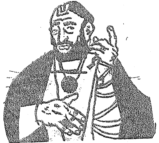
"make broad their phylacteries"

When the fraternity read Exodus 13, vv. 9 and 16 it took these verses literally, not figuratively. These verses state the Law "shall be a sign unto thee upon thy hands and for a memorial between thine eyes." In keeping with their interpretations, Pharisees made leather boxes into which they placed four specific scriptural passages and then placed them on their arm and forehead at morning prayer. Jesus, of course, objected to them because they made a parade of them, widening them so they would become more noticeable. A reading of the auxiliary laws regulating the wearing of phylacteries reads like the daily comics.