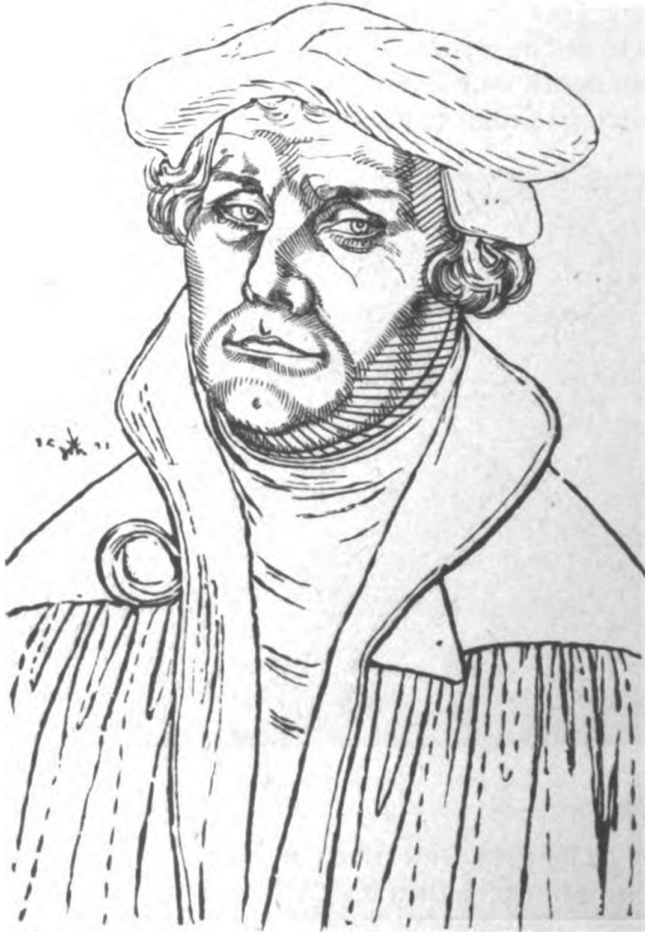
Picture of Luther according to a painting by Cranach in 1528