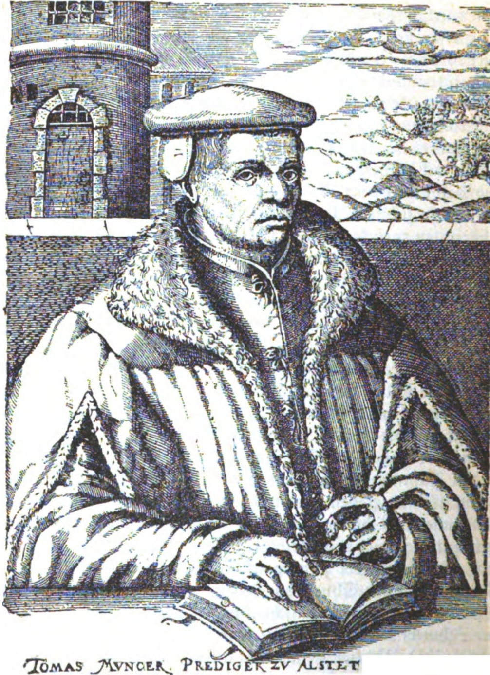
Picture of Thomas Muenzer according to an old woodcut