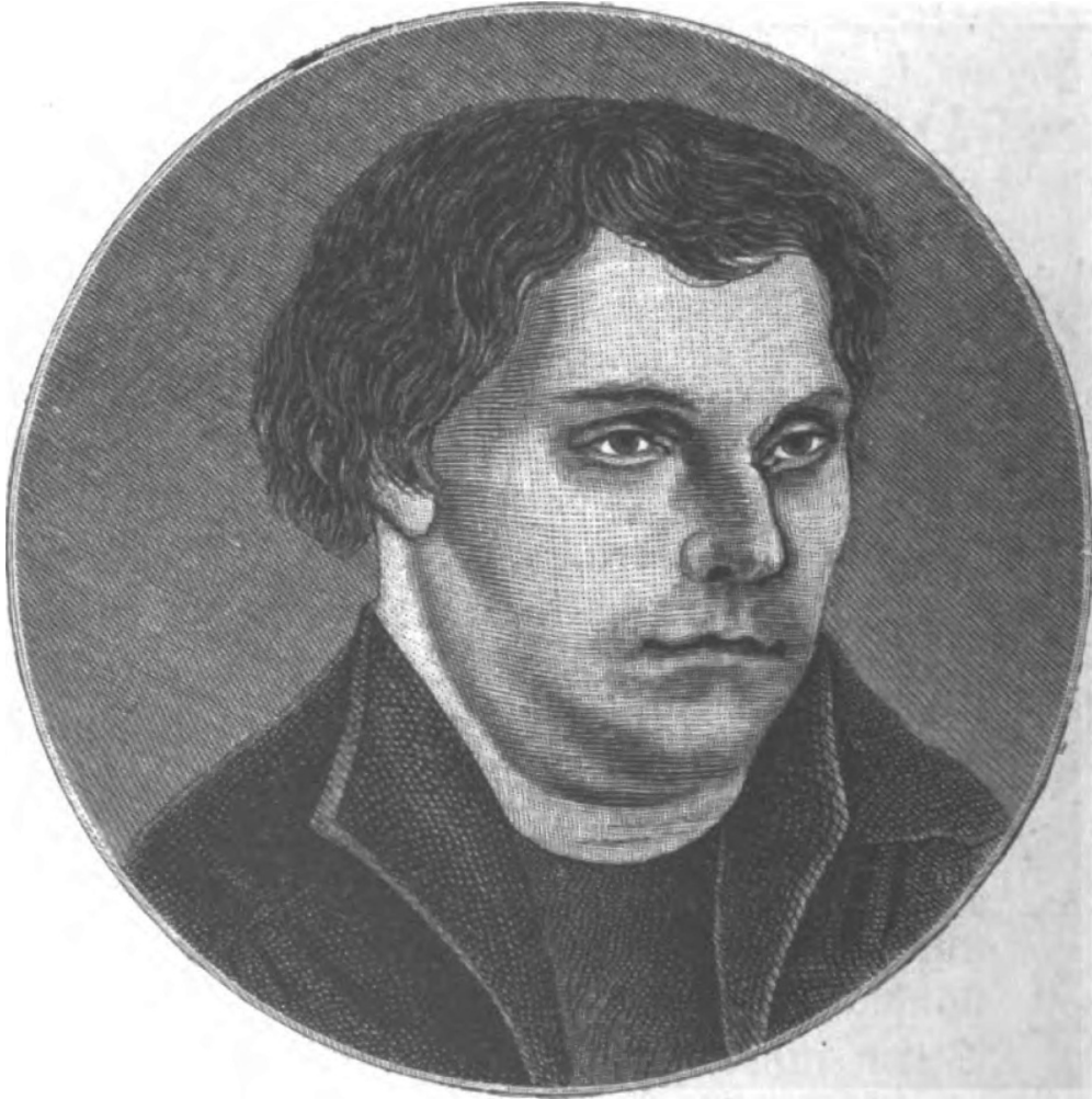
Luther according to a painting by Cranach, 152