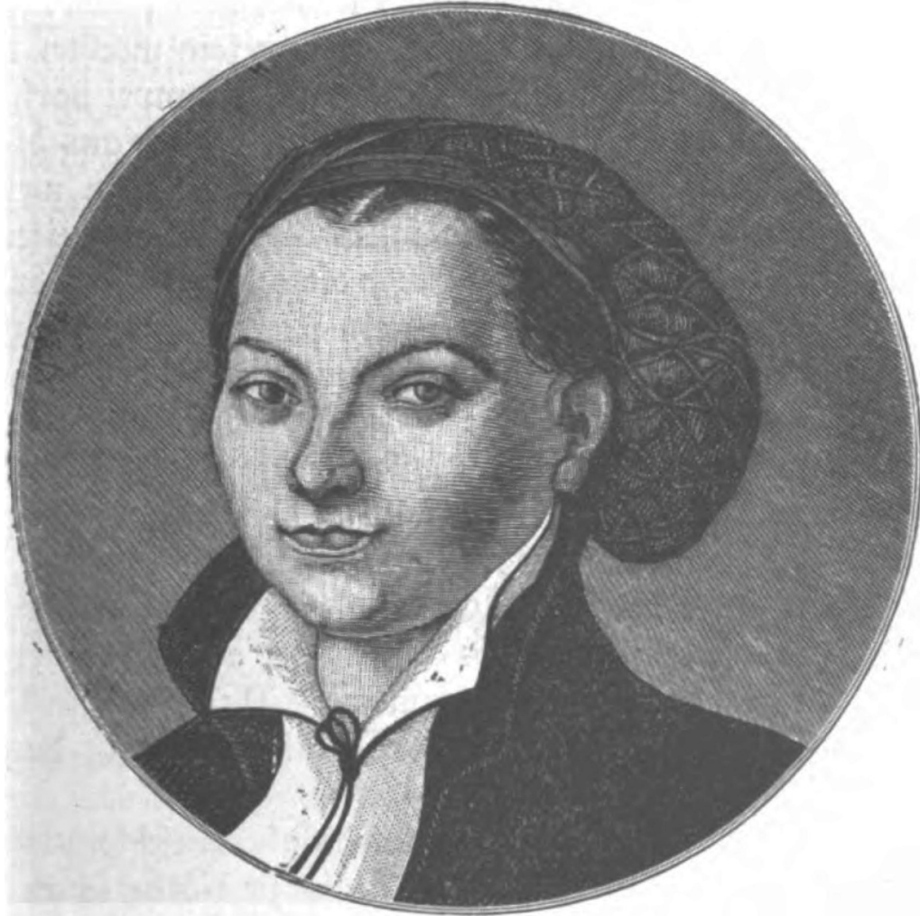
Katharina Luther, nee v. Bora, according to a painting by Cranach, 1525

Thus it is understandable for her to make her offer, by which she gratefully expressed her warm regard for Luther. Luther, who himself was of an honest and frank nature, may well have been moved by the open honesty of this woman who had been abandoned.