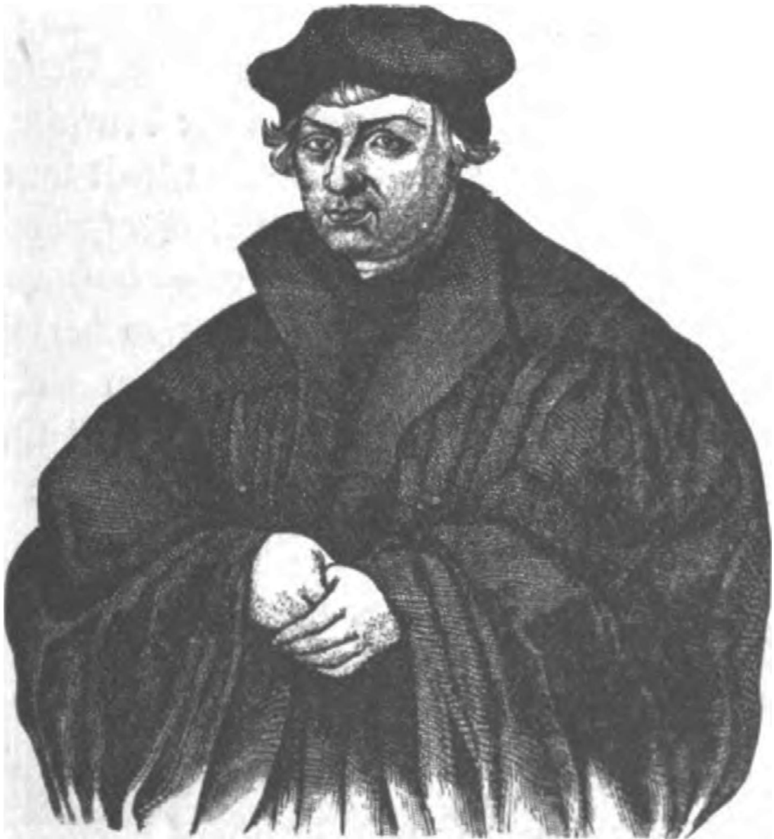
Painting of Bugenhagen of 1543 according to Cranach

In the so-called genealogical book in Berlin