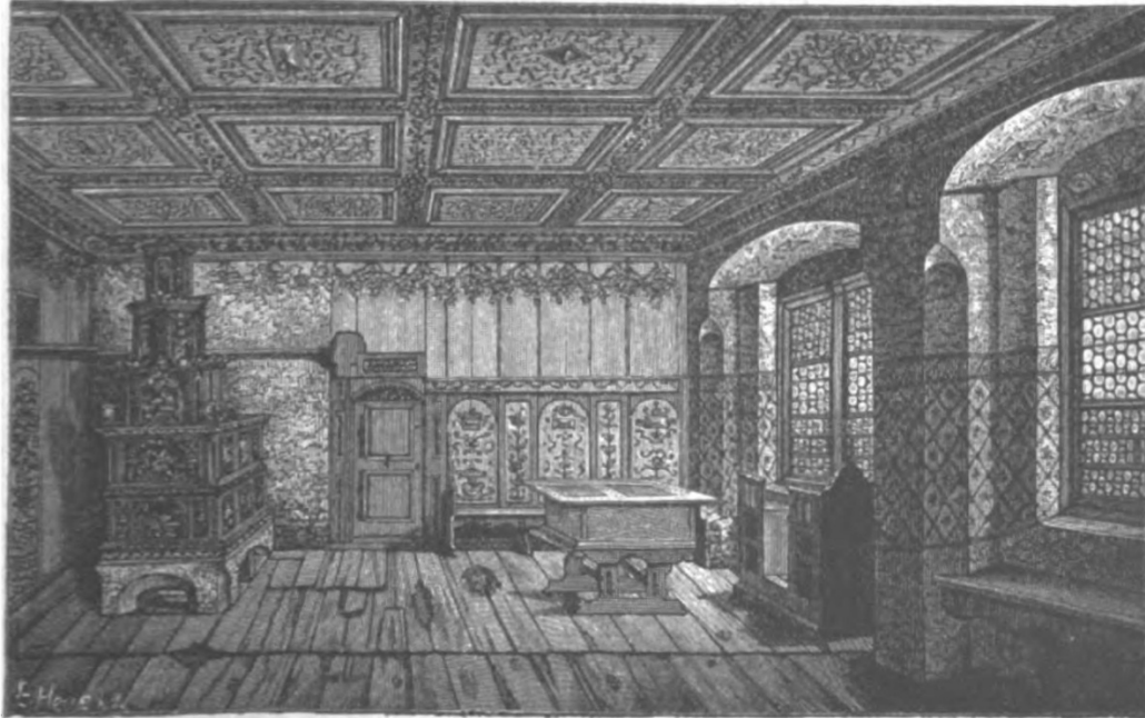
Picture of the Chamber in the Home of the Reformer