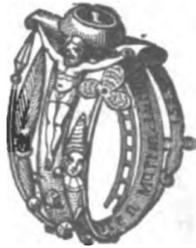
Display of the Wedding Ring pertaining to Martin and Catarina Luther

Wedding rings were most likely not used in Luther's marriage ceremony. Yet two rings are still being displayed in memory of the occasion. Katharina may have given one of them to Luther later as a remembrance of their wedding day. It is skillfully finished in filigreed and raised gold-work. Besides a ruby it shows the image of the crucified Savior, the instruments of torture, and the dice of the soldiers. On the inside flat surfaces is the inscription: D. Martino Luthero Catharina v. Boren, June 13, 1525.