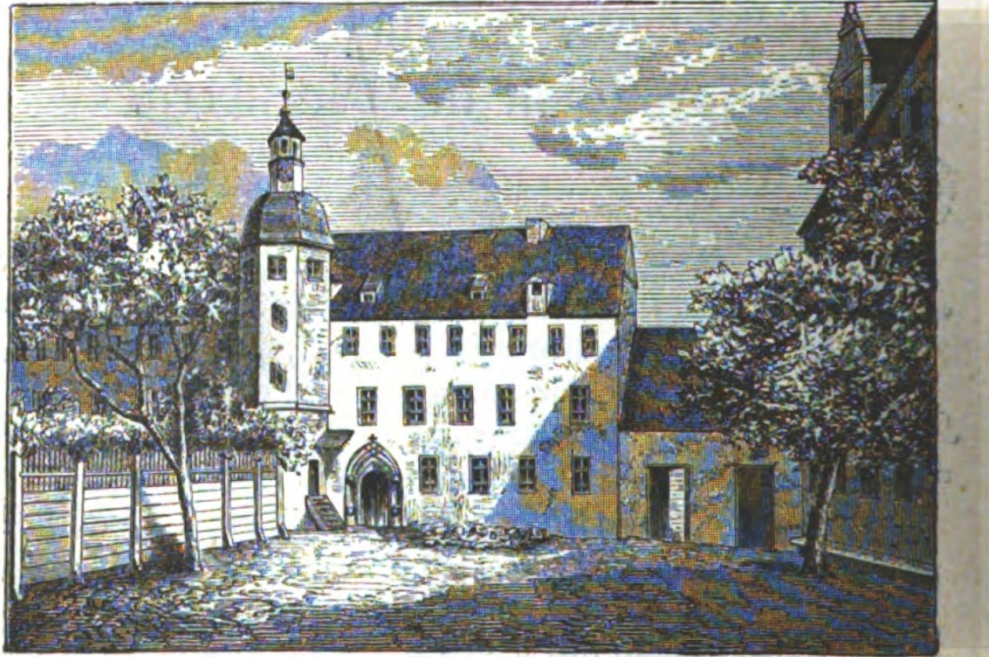
Picture of the Luther Home, formerly Augustinian Monastery

As he had faithfully stood in support of Pastor Bugenhagen at that time, the entire relationship between Luther and his dear "Doctor Pommer" was an overall pleasant one. Not only did Luther regard him highly as a friend but also as caretaker of his soul. He diligently sought comfort from him, confessed his sins to him, and was absolved by him. He also joined with the congregation to listen to the sermons and to the Lord's Table. During that time he also stood faithfully at his side, assisting in the pastoral office, and continued to build the congregation up through his counsel. During following years Bugenhagen, because of his special gifts of administration in church life, was often used in other places. Luther maintained the pastoral office for him during his absence.