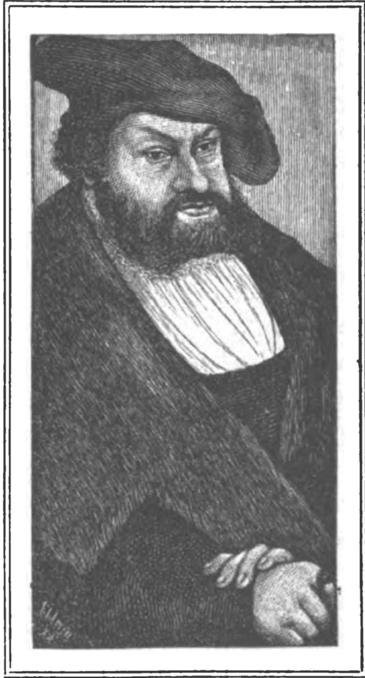
Frederick the Wise (1486-1525)