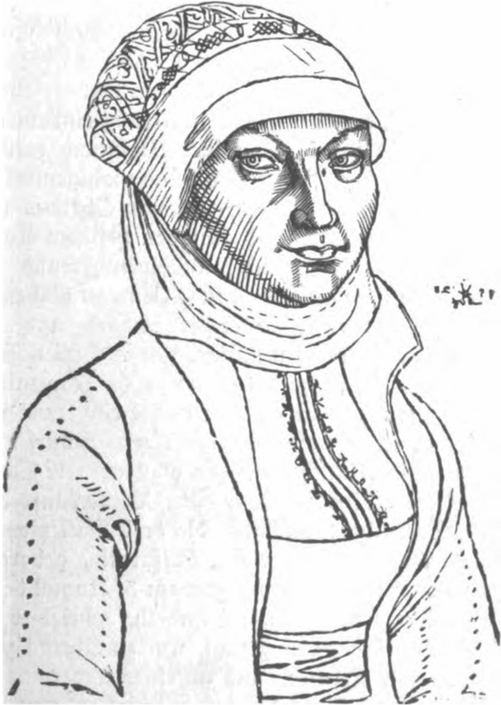
A picture of Luther's wife according to a painting by Cranach in 1528.