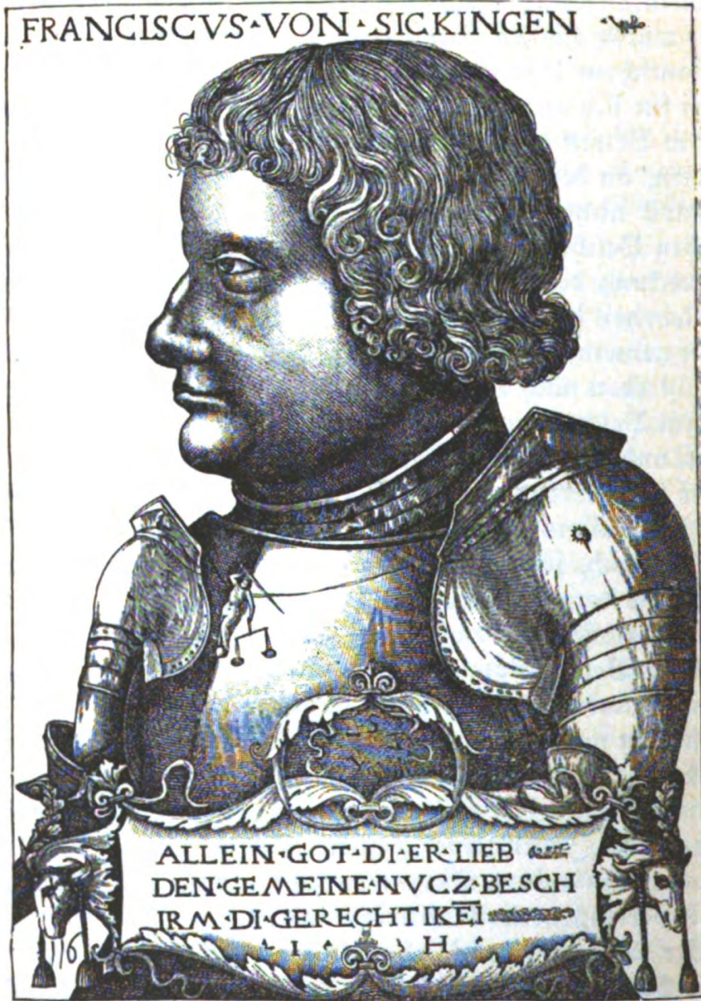
Picture of Franz von Sickingen according to an old copper plate engraving