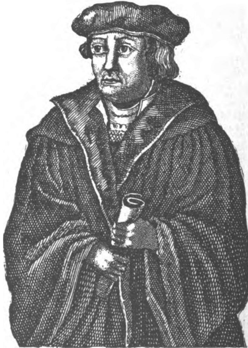
Dr. Johannes Eck according to an old woodcut

But when they approached Luther on the Monday after the opening of the debate, he told them that he did not want to hear anything about those conditions.