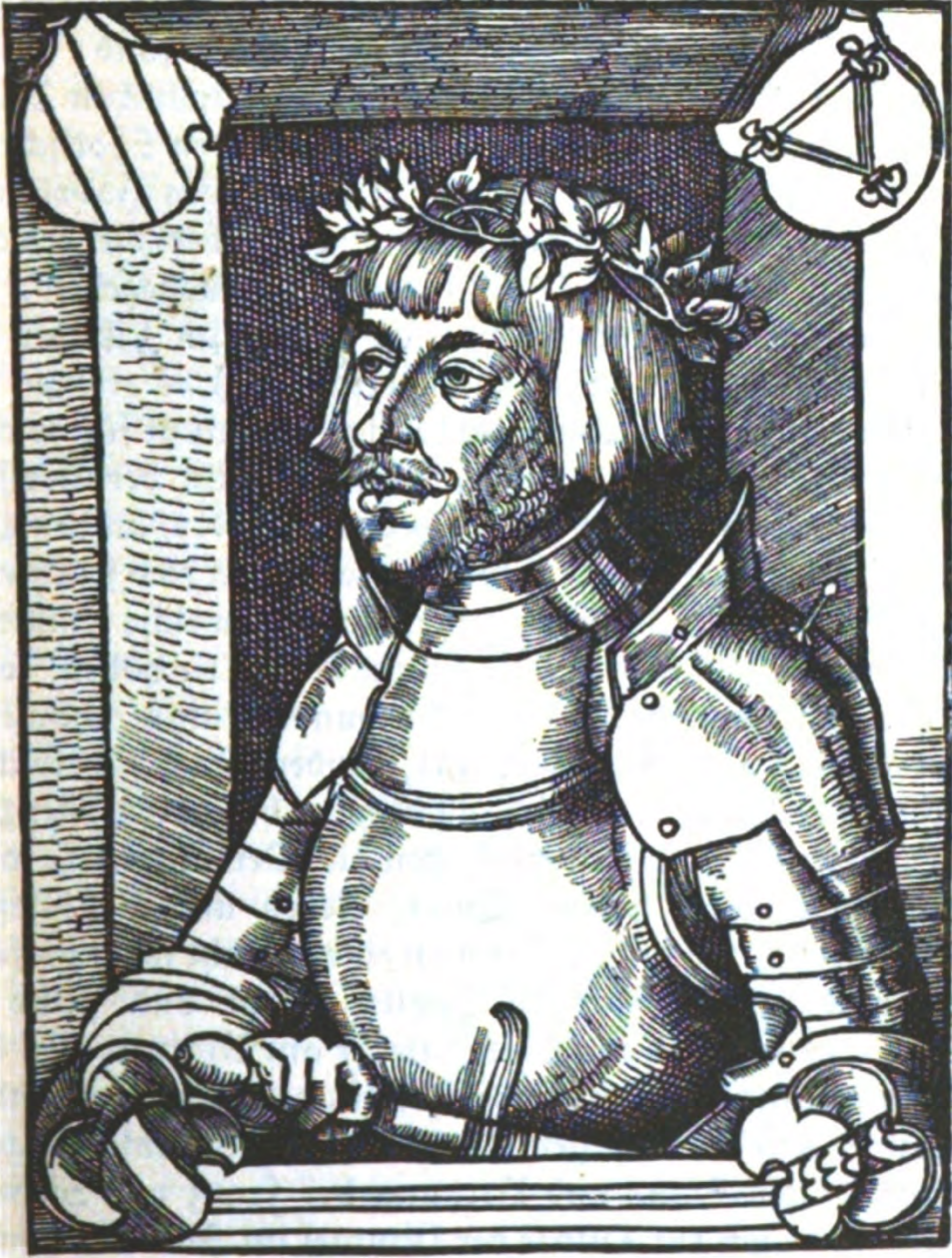
Woodcut of Ulrich von Hutten

had only a few possessions. Then, after a short stay in Bologna, he became a soldier of Caesar because he faced such bitter poverty. After a short stay in his