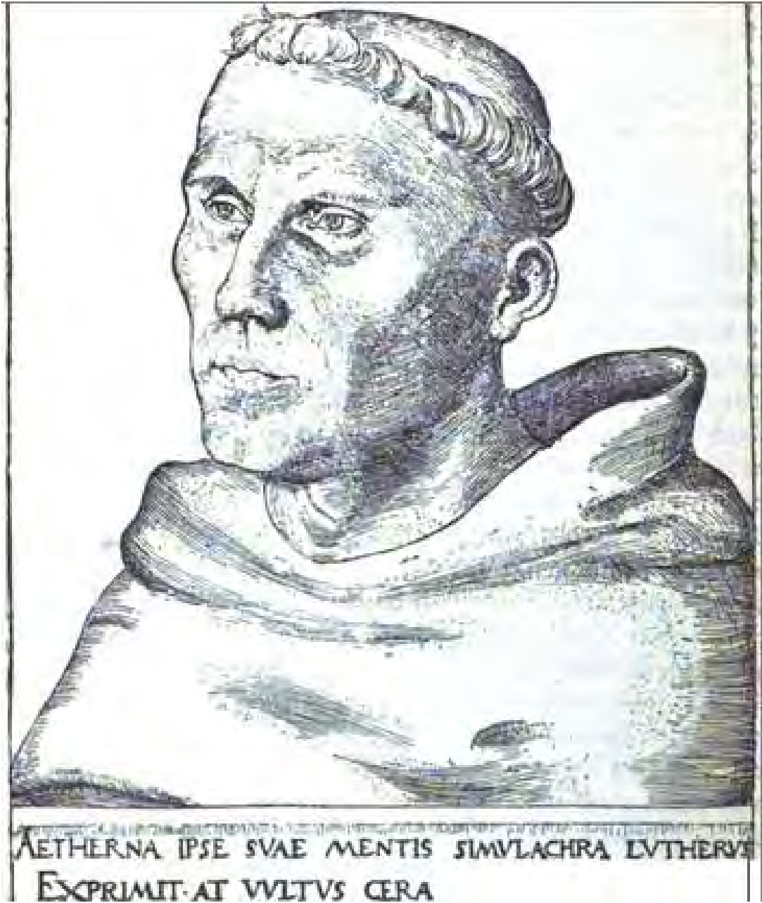
Picture of Luther on an engraved Copper Plate by Cranach in 1520