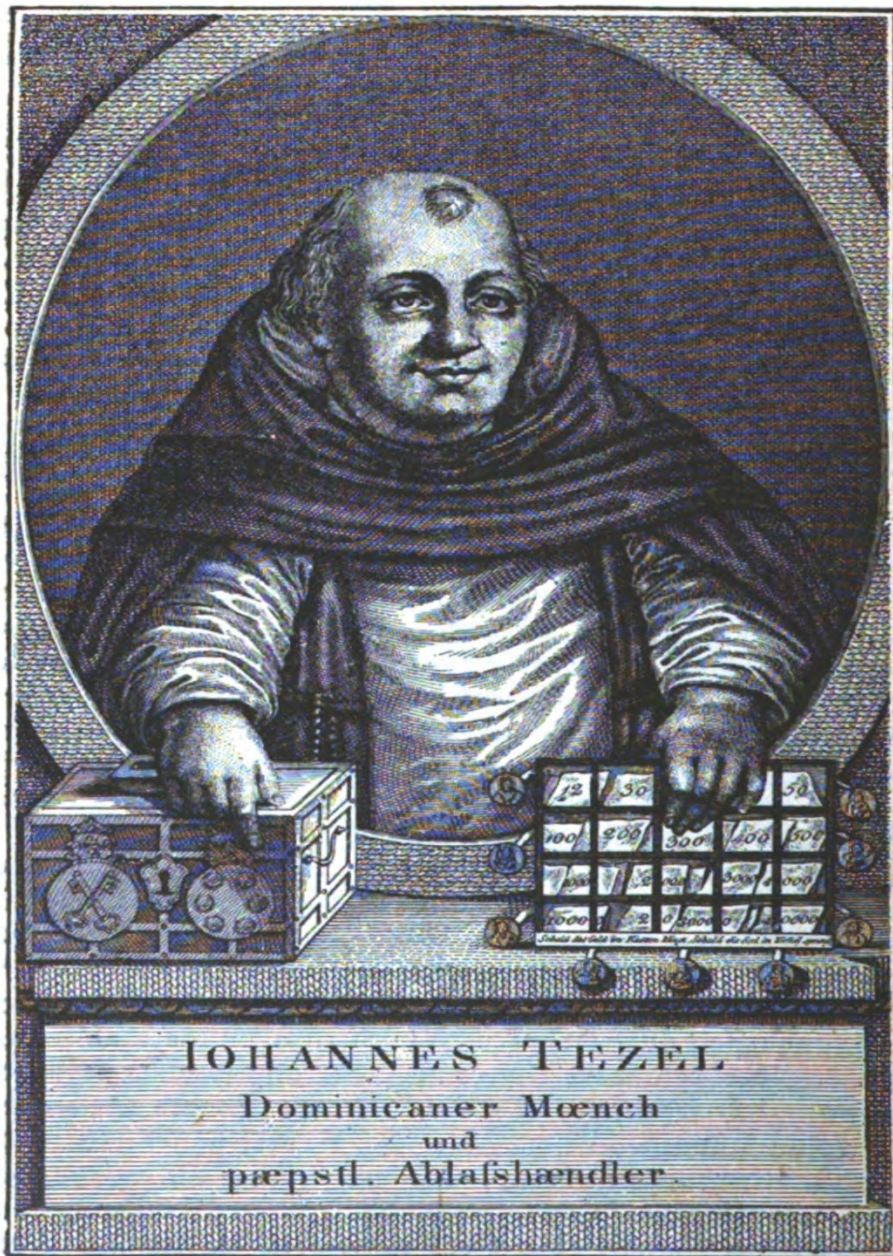
Picture of John Tetzel, Dominican Monk and Seller of Papal Indulgence

penance. Still, the right to arbitrarily assign monetary indulgence did not belong to a common priest or bishop. This authority belonged solely to the