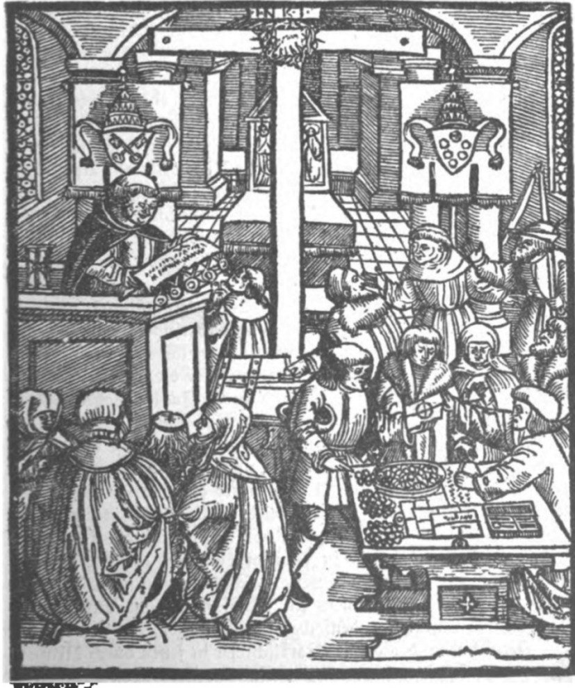
Illustration of an Indulgence Market

Title page from a pamphlet during the time of the beginning of the Reformation