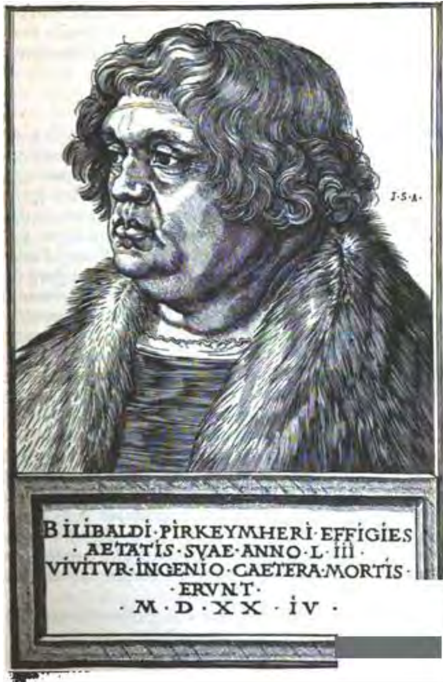
Picture of Billibald Pirckheimer according to Albrecht Dürer