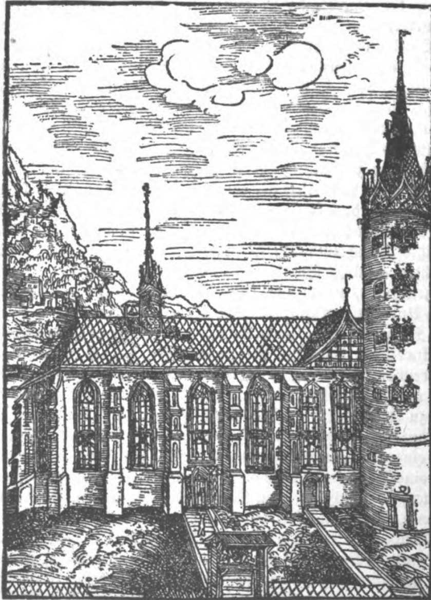
Picture of the Castle Church of Wittenberg from the year 1509

indulgence commissioners, who state that a person is set free, separated from all sins and saved through the pope's indulgence, are in error."