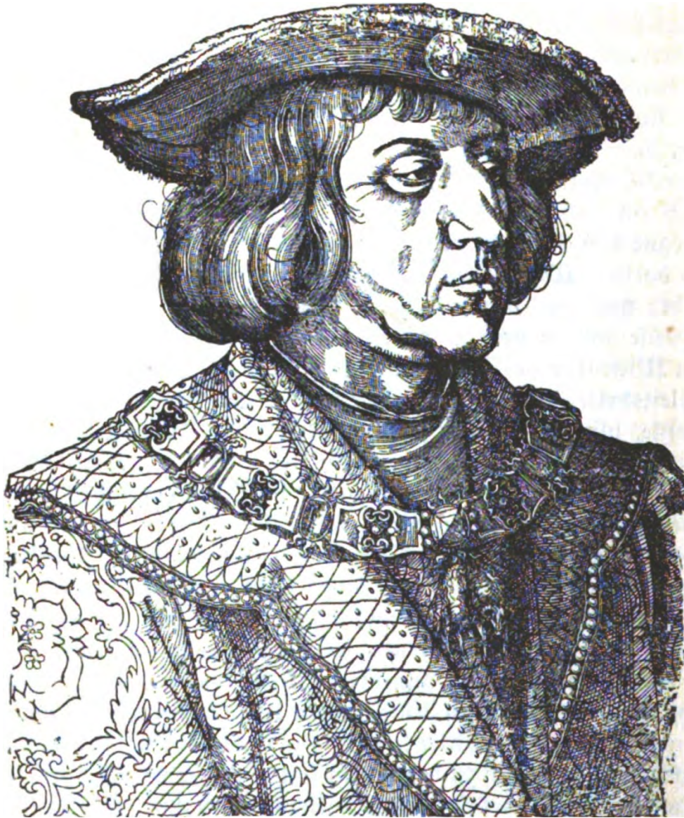
Caesar Maximilian according to Albrecht Dürer

appealed this point to the pope for a council. The legate responded that they would have to take their punishment.