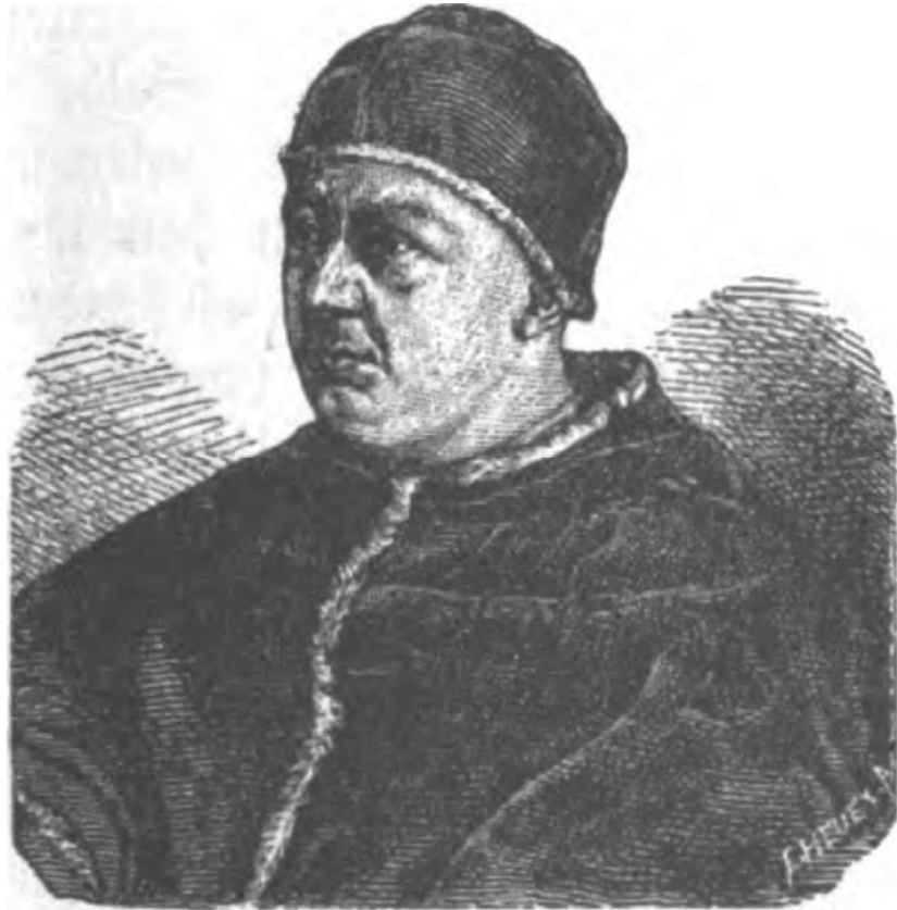
Picture of Pope Leo X by Raphael

these was the Archbishop Albrecht of Mainz and Magdeburg. He was selected by the monasteries within his territory because of a promise he had made regarding the money to be paid to the pope for the pallium, the white archbishop's collar, blessed by the pope and adorned with crosses. He promised not to take the funds from the archepiscopal foundation but to raise the money himself. Accordingly he borrowed 30,000 gold guilders