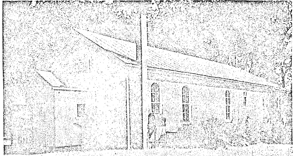
WHERE FREE THINKERS ONCE MET—This brick building, now the Town of Barre Hall, was built by the Bostwick Valley movement of Free Thinkers which began in 1870 and ended in 1916.